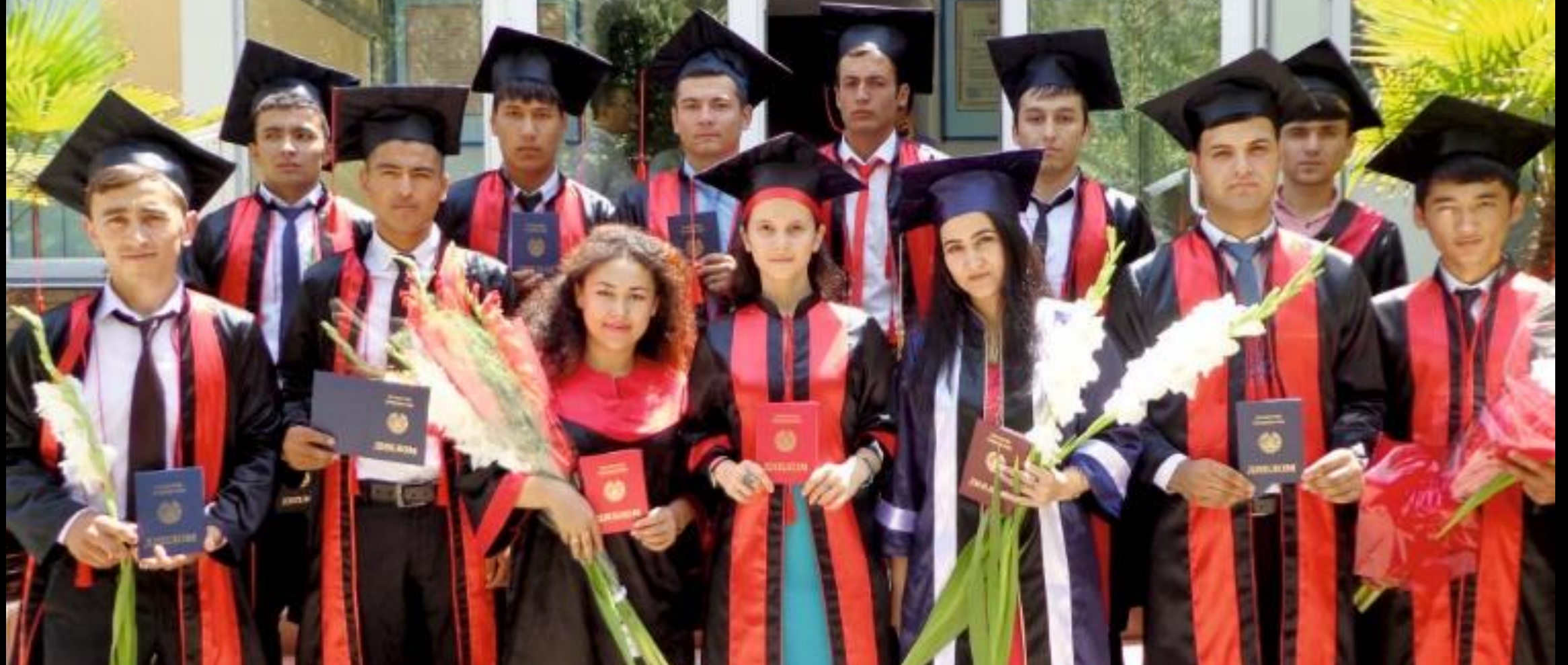
IET TSUC graduates, 2017-2018