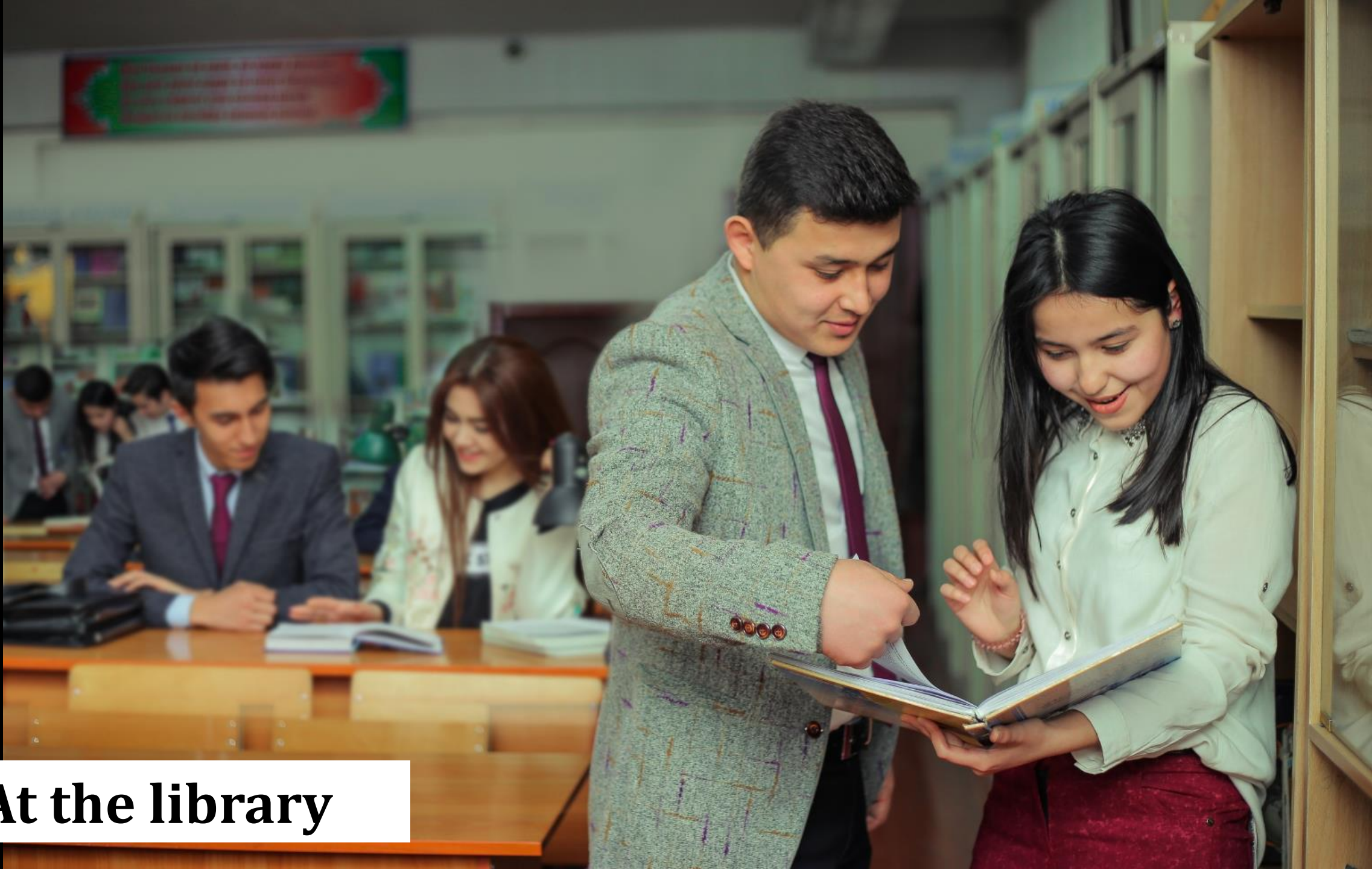
At the library