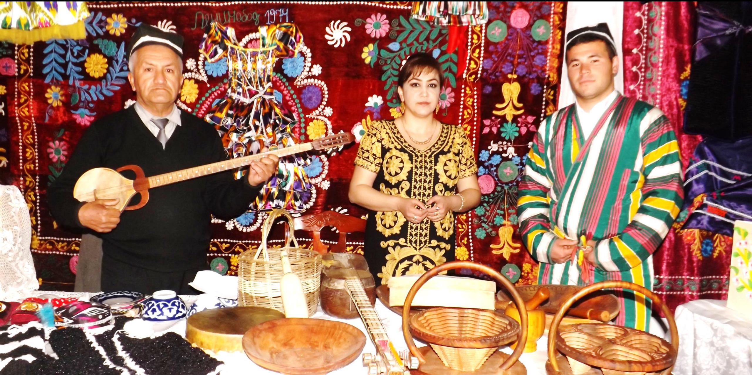
Events within university: Year of folk crafts