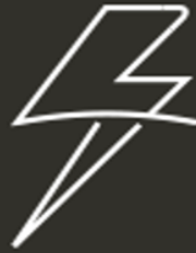
Electrical and Electronics Engineering