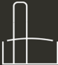
Industrial Engineering and Management